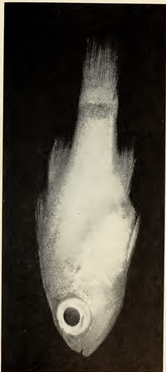
Fig. 1. Apogon mosavi , holotype, AMNH 35782, 29.7 mm SL, off Cat Island, Bahamas.